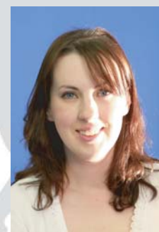
3. Image with uneven shadowing due to poorly directed lighting.