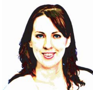
2. Image with no definition.