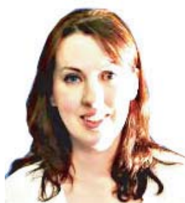
1. Low resolution, poorly lit image under 100 dpi.