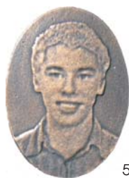
50 x 70 mm