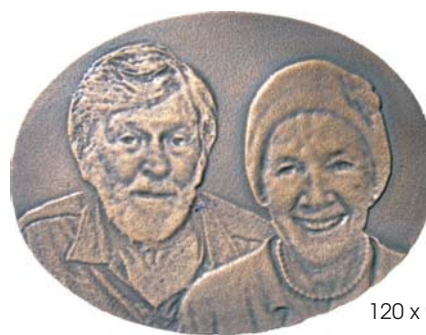
120 x 90 mm

"Bronze image" portraits are available in 3 sizes: 70x50, 90x70 and 120x90 mm. All images are finished with a standard brown patina and are available in both landscape and portrait options. If you require another size please speak to our friendly customer service staff.