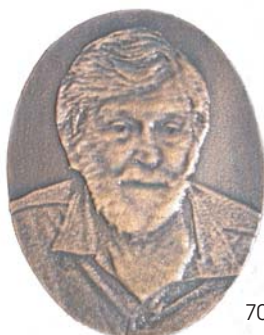
70 x 90 mm